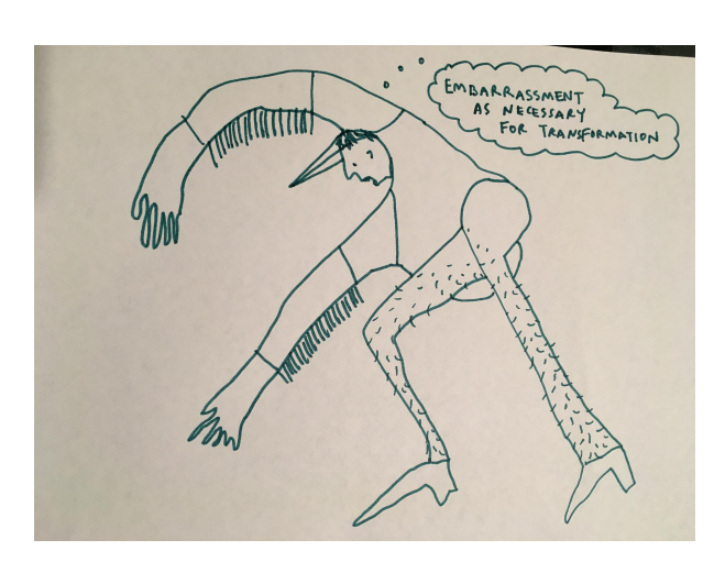
Eli Nixon, Embarassment, 2020

My proposal for "Bloodtide", a new holiday in homage to horseshoe cabs, complete with an illustrated manual for enacting the holiday in a multitude of forms, will be published by 3rd Thing Press in October. Spending part of September at Millay was instrumental to the development of this work and, hopefully eventually, the manifestation of this holiday's commemoration everywhere. Vincent's Steepletop vapors fueled my explorations into Naturedrag, while the landscape provided a blazing autumnal audience of trees for my awkward, beastly-beyond-binary embodiments.