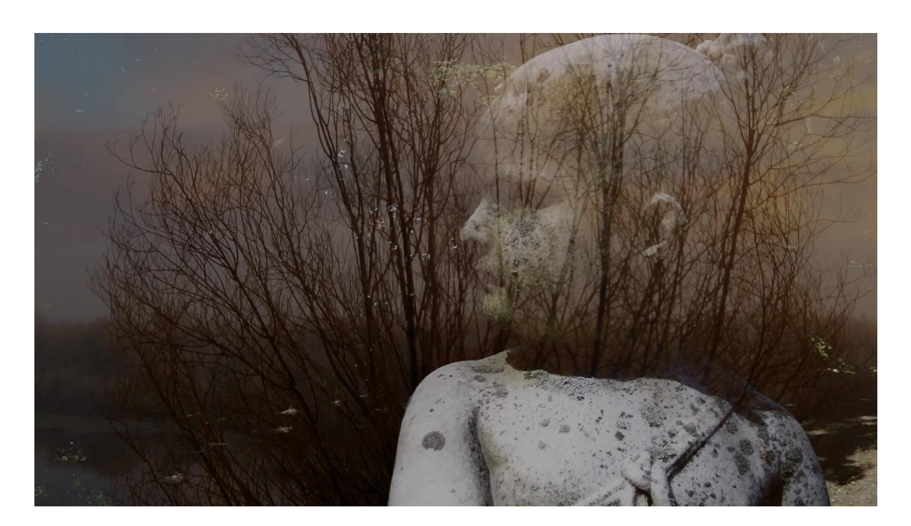
Melissa Hacker, Still from Falling, 2020 The statue at Millay superimposed over trees at Playa, OR